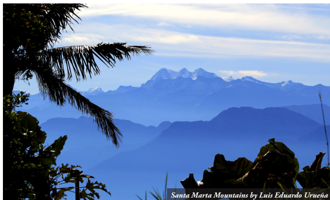
Santa Marta Mountains