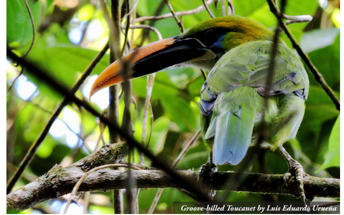
Groove-billed Toucanet

Transfer to the airport for return flights to the U.S. (B)